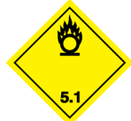
Class 5.1 HAZARD Oxidizing Substances

ADR , Annex A General provisions and provisions concerning dangerous substances and articles; Classification; Class Specific Provisions